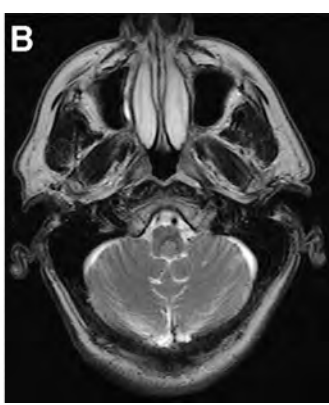
FIGURE 11.1. Axial T2-weighted MRIs of two patients referred for radiosurgery that were not acceptable candidates. A, A 29-year-old woman with acute onset of headache and ataxia. MRI shows a right cerebellar hemorrhage from a cavernous malformation. The patient was symptomatic from this surgically accessible lesion and resection was performed without incident. B, A 72-year-old man with dizziness. MRI shows cavernous malformation on the floor of the fourth ventricle. Without a history of hemorrhage, observation was recommended.

formation. Many vessels were obliterated; however, there was a large number of newly formed thin-walled channels. Overall, it appears that radiosurgery induces a similar response in CMs that has been observed in subtotally obliterated AVMs, although the number of specimens examined to date remains small.