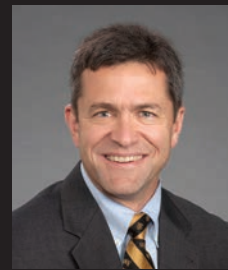
John A. Wilson Meritorious Member Award, Spine