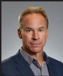
Robert F. Heary Meritorious Award, Neurosurgery