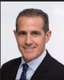
Rolando Garcia Meritorious Award, Orthopedic Surgery

Meritorious Awardees will share their knowledge during award presentations, courses, debates, and Scientific Sessions.